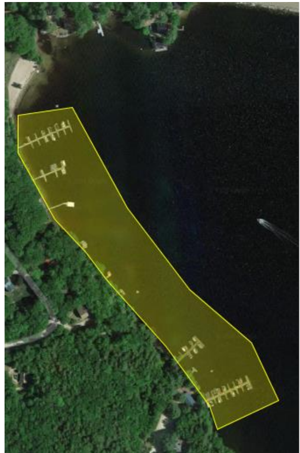
Knights Hill Marina. Lots of native milfoil found in this area and throughout the north basin.