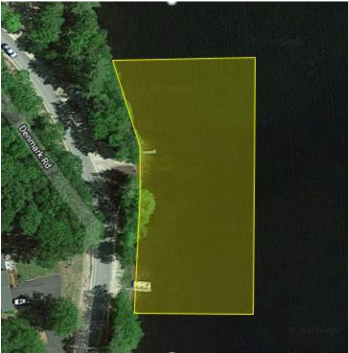
Clockwise from top right: Bridgton Boat launch; Narrows near Mountain Road bridge; and Denmark Boat Launch. Native milfoil was found in the narrows for the first time.