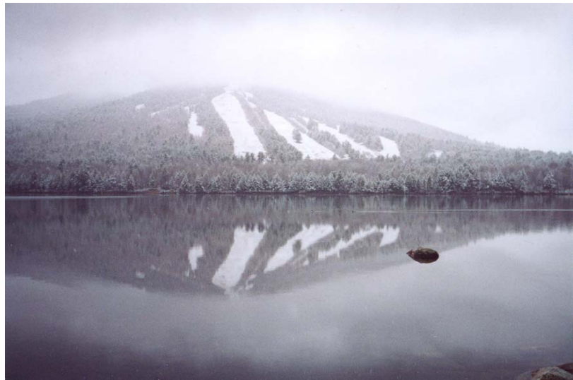
Snow on the ski slopes of Pleasant Mountain reflects over the cool and tranquil waters of Moose Pond in the late fall.