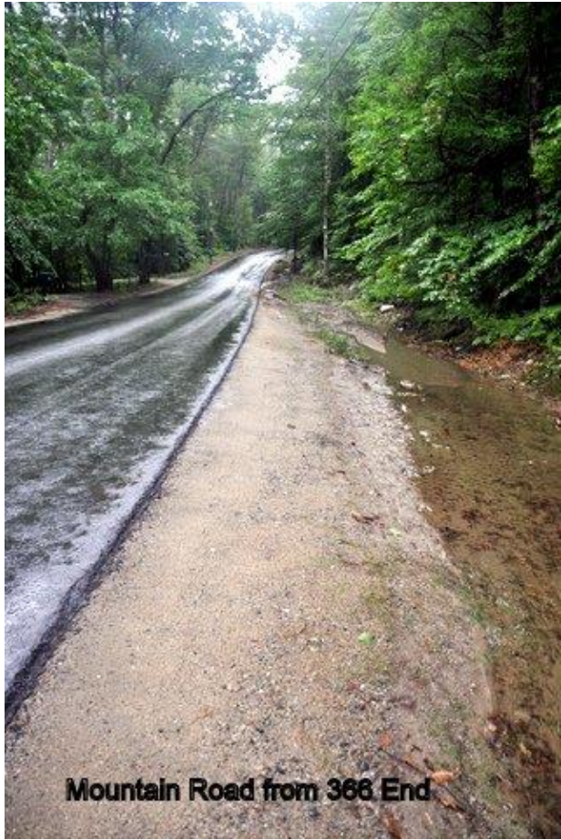
Mountain Road from 366 End