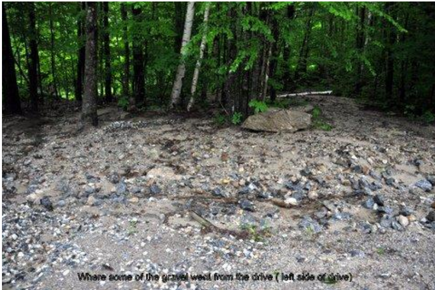
Where some of the gravel went from the drive (left side of drive)