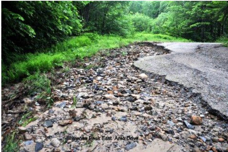
Shawnee Peak East Area Drive