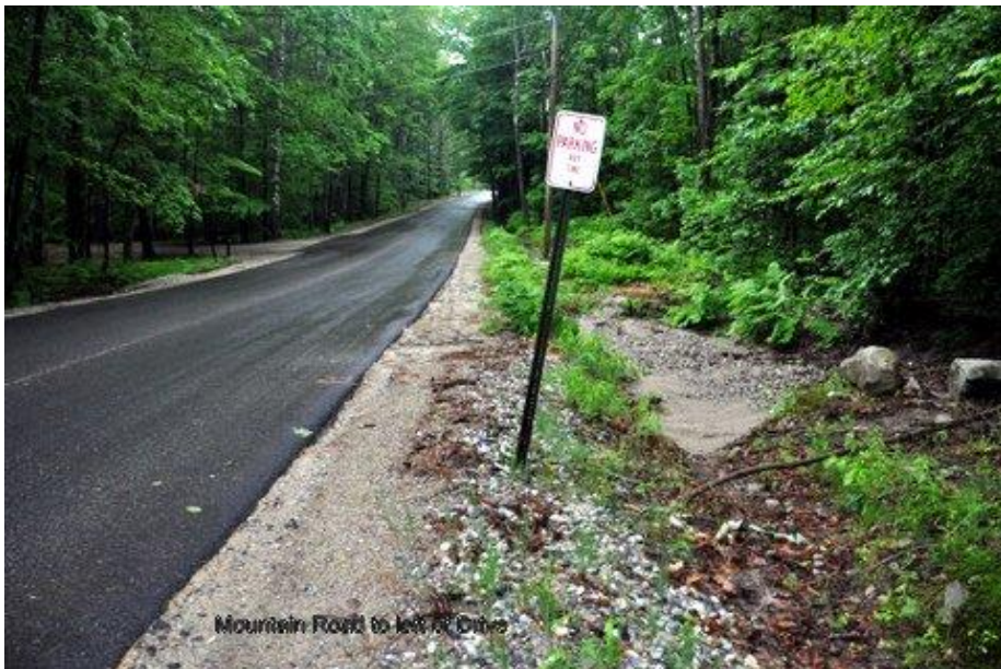
Mountain Road to left of Drive